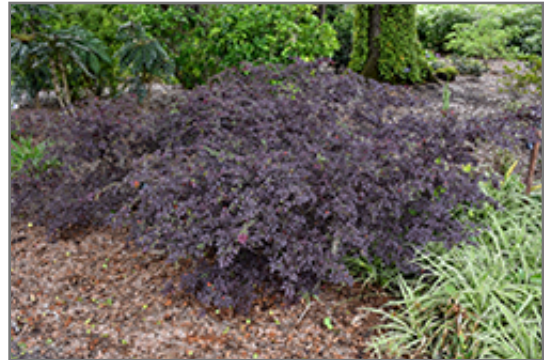
Purple Daydream Fringeflower

Purple Daydream Fringeflower will grow to be about 3 feet tall at maturity, with a spread of 4 feet. Although it is technically a woody plant, this fast-growing plant can be expected to behave as a perennial in our climate if planted outdoors over the winter, usually regrowing from its base (crown) the following year. As such, gardeners should take into consideration that it will perform differently than it would in its native habitat.