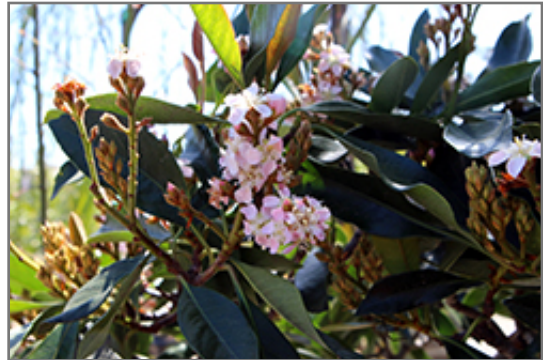
Coppertone Loquat flowers

This plant is not reliably hardy in our region, and certain restrictions may apply; contact the store for more information.