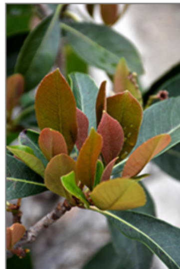
Coppertone Loquat foliage

Coppertone Loquat is clothed in stunning panicles of fragrant pink star-shaped flowers with tan eyes at the ends of the branches from mid to late fall. It has attractive dark green foliage with grayish green undersides which emerges coppery-bronze in spring. The glossy oval leaves are highly ornamental and remain dark green throughout the winter. The fruits are showy yellow pomes carried in abundance from early to late winter. The fruit can be messy if allowed to drop on the lawn or walkways, and may require occasional clean-up. The smooth gray bark adds an interesting dimension to the landscape.