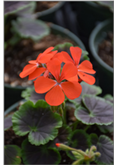
Brocade Fire Night Geranium flowers