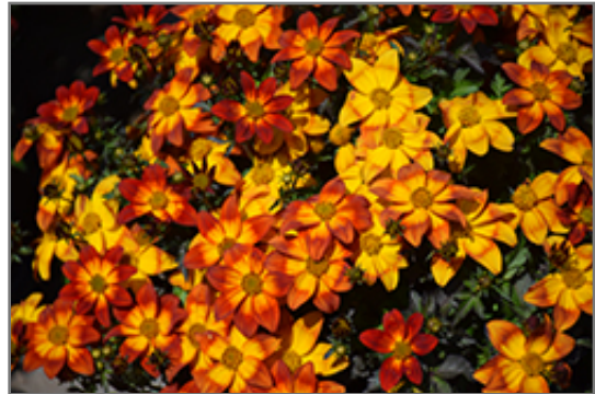
Blazing Fire Bidens flowers

Blazing Fire Bidens will grow to be about 14 inches tall at maturity, with a spread of 12 inches. When grown in masses or used as a bedding plant, individual plants should be spaced approximately 10 inches apart. Its foliage tends to remain dense right to the ground, not requiring facer plants in front. Although it's not a true annual, this fast-growing plant can be expected to behave as an annual in our climate if left outdoors over the winter, usually needing replacement the following year. As such, gardeners should take into consideration that it will perform differently than it would in its native habitat.