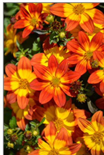
Blazing Fire Bidens flowers

This is a relatively low maintenance plant, and should not require much pruning, except when necessary, such as to remove dieback. It is a good choice for attracting butterflies to your yard. It has no significant negative characteristics.