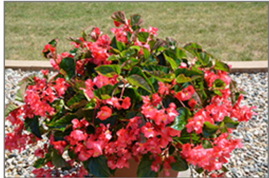
Megawatt Rose Green Leaf Begonia in bloom

Megawatt Rose Green Leaf Begonia is a fine choice for the garden, but it is also a good selection for planting in outdoor containers and hanging baskets. With its upright habit of growth, it is best suited for use as a 'thriller' in the 'spiller-thriller-filler' container combination; plant it near the center of the pot, surrounded by smaller plants and those that spill over the edges. It is even sizeable enough that it can be grown alone in a suitable container. Note that when growing plants in outdoor containers and baskets, they may require more frequent waterings than they would in the yard or garden.