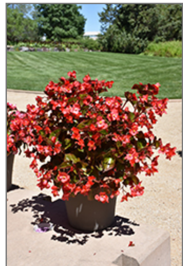
Megawatt Red Bronze Leaf Begonia flowers