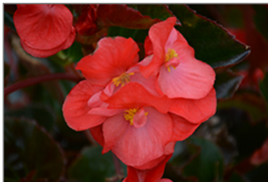
Megawatt Red Bronze Leaf Begonia flowers

Megawatt Red Bronze Leaf Begonia is a fine choice for the garden, but it is also a good selection for planting in outdoor containers and hanging baskets. With its upright habit of growth, it is best suited for use as a 'thriller' in the 'spiller-thriller-filler' container combination; plant it near the center of the pot, surrounded by smaller plants and those that spill over the edges. It is even sizeable enough that it can be grown alone in a suitable container. Note that when growing plants in outdoor containers and baskets, they may require more frequent waterings than they would in the yard or garden.