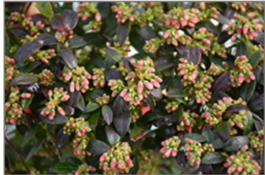
Blueberry Glaze Blueberry flowers

Blueberry Glaze Blueberry features dainty clusters of white bell-shaped flowers hanging below the branches in mid spring, which emerge from distinctive rose flower buds. It has dark green deciduous foliage. The glossy oval leaves turn outstanding shades of yellow, red and deep purple in the fall. It features an abundance of magnificent navy blue berries in mid summer.