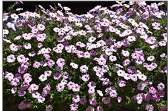
ColorRush Pink Star Petunia in bloom

ColorRush Pink Star Petunia will grow to be about 12 inches tall at maturity, with a spread of 30 inches. When grown in masses or used as a bedding plant, individual plants should be spaced approximately 24 inches apart. Its foliage tends to remain dense right to the ground, not requiring facer plants in front. This fast-growing annual will normally live for one full growing season, needing replacement the following year.