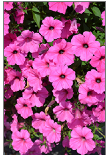
ColorRush Pink Petunia flowers

ColorRush Pink Petunia is recommended for the following landscape applications;