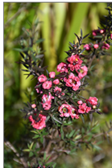
Red Damask Tea-Tree flowers

This plant is not reliably hardy in our region, and certain restrictions may apply; contact the store for more information.