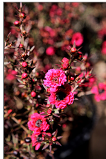
Red Damask Tea-Tree flowers