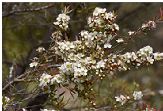
Broom Tea-Tree flowers