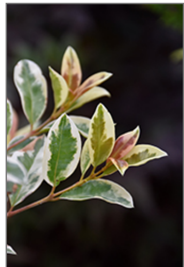
Lemon Swirl Variegated Brush Cherry foliage