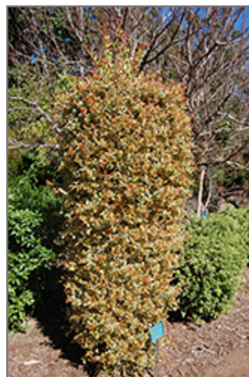
Lemon Swirl Variegated Brush Cherry

This plant is not reliably hardy in our region, and certain restrictions may apply; contact the store for more information.