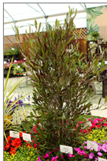
Purple Hop Bush