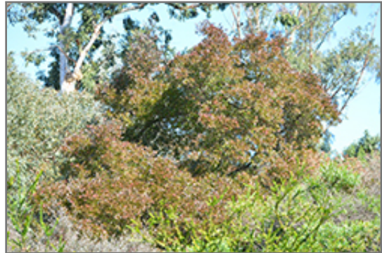
Purple Hop Bush

This shrub does best in full sun to partial shade. It prefers dry to average moisture levels with very well-drained soil, and will often die in standing water. It is not particular as to soil type or pH, and is able to handle environmental salt. It is highly tolerant of urban pollution and will even thrive in inner city environments. This is a selection of a native North American species.