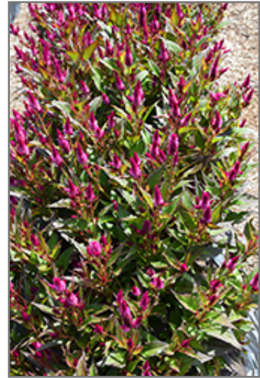
Kelos Atomic Violet Celosia in bloom

Kelos Atomic Violet Celosia is a fine choice for the garden, but it is also a good selection for planting in outdoor containers and hanging baskets. It is often used as a 'filler' in the 'spiller-thriller-filler' container combination, providing a mass of flowers against which the larger thriller plants stand out. Note that when growing plants in outdoor containers and baskets, they may require more frequent waterings than they would in the yard or garden.