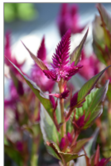
Kelos Atomic Violet Celosia flowers