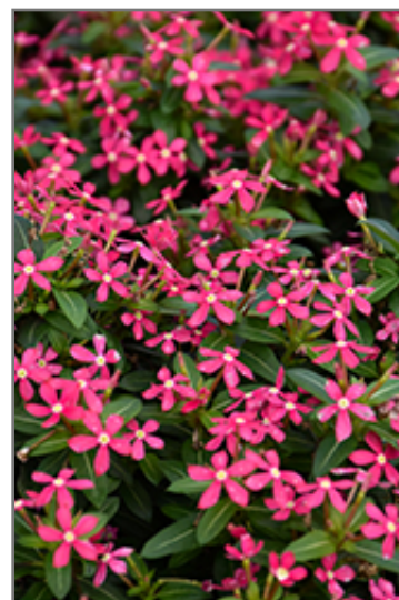
Soiree Kawaii Coral Vinca flowers

Soiree Kawaii Coral Vinca is recommended for the following landscape applications;