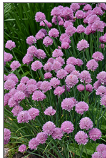
Pink Giant Chives flowers

Pink Giant Chives is recommended for the following landscape applications;