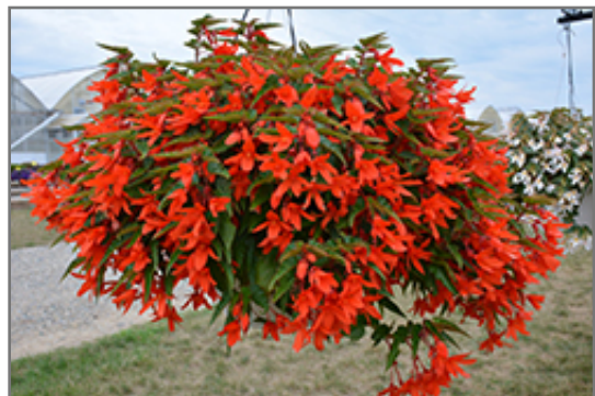
Waterfall Encanto Orange Begonia in bloom