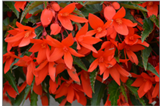
Waterfall Encanto Orange Begonia flowers

This is a high maintenance plant that will require regular care and upkeep, and usually looks its best without pruning, although it will tolerate pruning. Deer don't particularly care for this plant and will usually leave it alone in favor of tastier treats. Gardeners should be aware of the following characteristic(s) that may warrant special consideration;