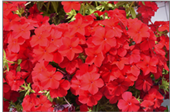
Intensia Red Hot Annual Phlox flowers

Intensia Red Hot Annual Phlox is recommended for the following landscape applications;