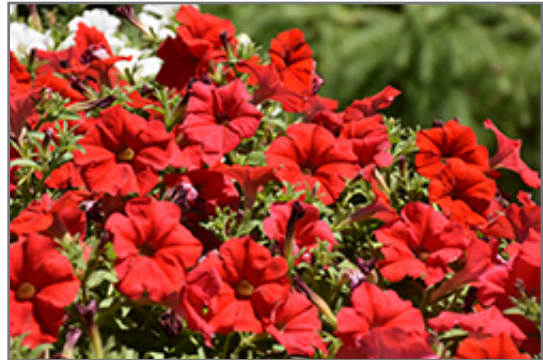
Supertunia Really Red Petunia flowers

Supertunia Really Red Petunia will grow to be about 8 inches tall at maturity, with a spread of 12 inches. When grown in masses or used as a bedding plant, individual plants should be spaced approximately 8 inches apart. Its foliage tends to remain low and dense right to the ground. This fast-growing annual will normally live for one full growing season, needing replacement the following year.