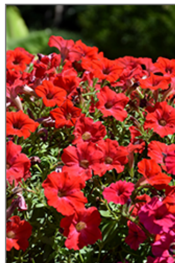
Supertunia Really Red Petunia flowers

Supertunia Really Red Petunia is recommended for the following landscape applications;