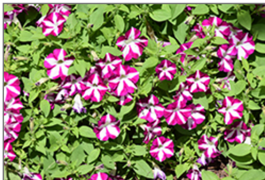
Blanket Rose Star Petunia flowers