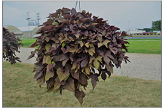
Sweet Caroline Sweetheart Red Sweet Potato Vine

Sweet Caroline Sweetheart Red Sweet Potato Vine is a fine choice for the garden, but it is also a good selection for planting in outdoor containers and hanging baskets. Because of its trailing habit of growth, it is ideally suited for use as a 'spiller' in the 'spiller-thriller-filler' container combination; plant it near the edges where it can spill gracefully over the pot. Note that when growing plants in outdoor containers and baskets, they may require more frequent waterings than they would in the yard or garden.