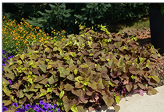
Sweet Caroline Sweetheart Red Sweet Potato Vine

Sweet Caroline Sweetheart Red Sweet Potato Vine is recommended for the following landscape applications;