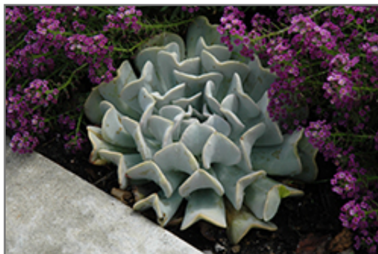
Topsy Turvy Echeveria