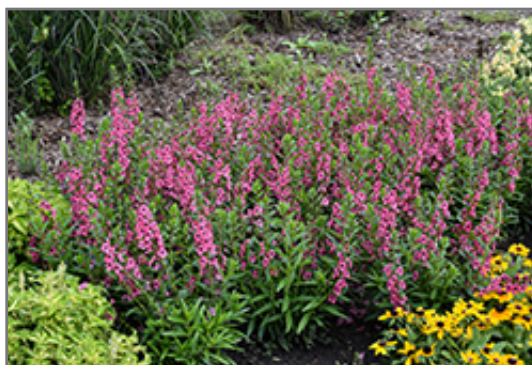
Angelface Perfectly Pink Angelonia in bloom