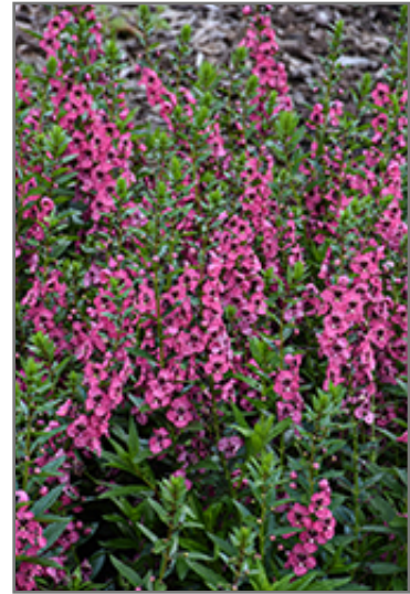
Angelface Perfectly Pink Angelonia flowers

Angelface Perfectly Pink Angelonia will grow to be about 20 inches tall at maturity, with a spread of 14 inches. When grown in masses or used as a bedding plant, individual plants should be spaced approximately 12 inches apart. Although it's not a true annual, this fast-growing plant can be expected to behave as an annual in our climate if left outdoors over the winter, usually needing replacement the following year. As such, gardeners should take into consideration that it will perform differently than it would in its native habitat.