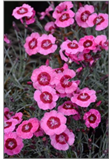
Star Single Peppermint Star Pinks flowers

Star Single Peppermint Star Pinks will grow to be only 6 inches tall at maturity extending to 8 inches tall with the flowers, with a spread of 12 inches. When grown in masses or used as a bedding plant, individual plants should be spaced approximately 8 inches apart. Its foliage tends to remain low and dense right to the ground. It grows at a medium rate, and under ideal conditions can be expected to live for approximately 10 years. As an evergreen perennial, this plant will typically keep its form and foliage year-round.