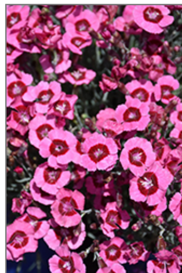
Star Single Peppermint Star Pinks flowers

This is a relatively low maintenance plant, and is best cleaned up in early spring before it resumes active growth for the season. It is a good choice for attracting bees and butterflies to your yard, but is not particularly attractive to deer who tend to leave it alone in favor of tastier treats. It has no significant negative characteristics.