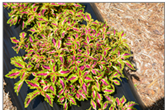
Terra Nova Jitters Coleus