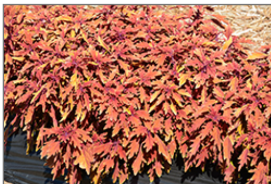
Terra Nova Fiona Coleus