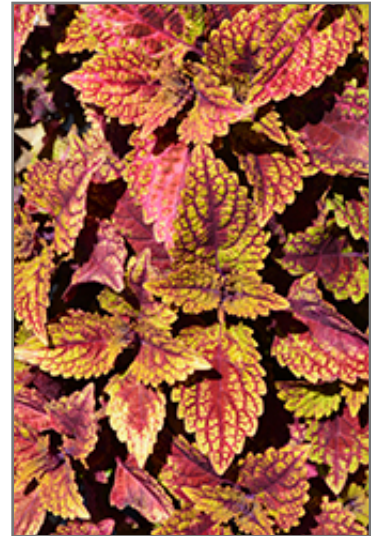
Color Clouds Spicy Coleus foliage

Color Clouds Spicy Coleus is recommended for the following landscape applications;