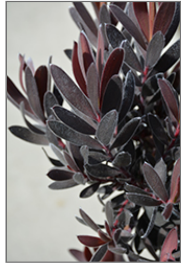
Ebony Conebush foliage

This plant is not reliably hardy in our region, and certain restrictions may apply; contact the store for more information.