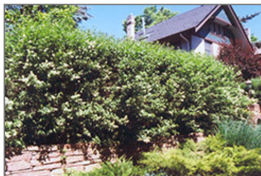
Common Privet in bloom