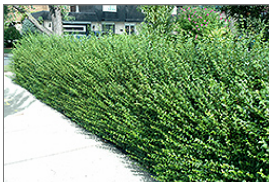
Amur Privet

Amur Privet will grow to be about 12 feet tall at maturity, with a spread of 8 feet. It tends to be a little leggy, with a typical clearance of 2 feet from the ground, and is suitable for planting under power lines. It grows at a fast rate, and under ideal conditions can be expected to live for approximately 30 years.