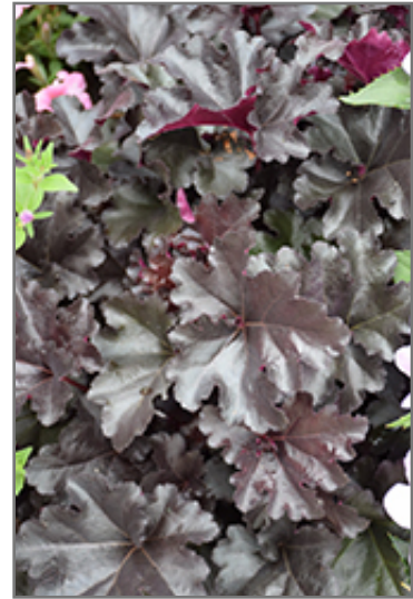
Black Pearl Coral Bells foliage

Black Pearl Coral Bells is recommended for the following landscape applications;