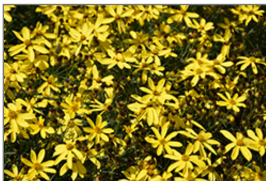
Mayo Clinic Flower Of Hope Tickseed flowers