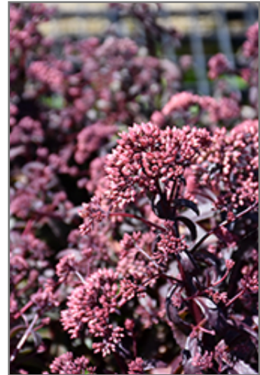
Desert Red Stonecrop flowers

This plant is not reliably hardy in our region, and certain restrictions may apply; contact the store for more information.