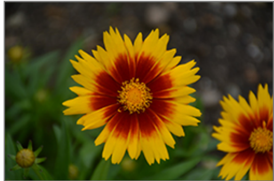
UpTick Gold and Bronze Tickseed flowers

UpTick Gold and Bronze Tickseed will grow to be about 12 inches tall at maturity, with a spread of 14 inches. Its foliage tends to remain dense right to the ground, not requiring facer plants in front. It grows at a medium rate, and under ideal conditions can be expected to live for approximately 10 years. As an herbaceous perennial, this plant will usually die back to the crown each winter, and will regrow from the base each spring. Be careful not to disturb the crown in late winter when it may not be readily seen!