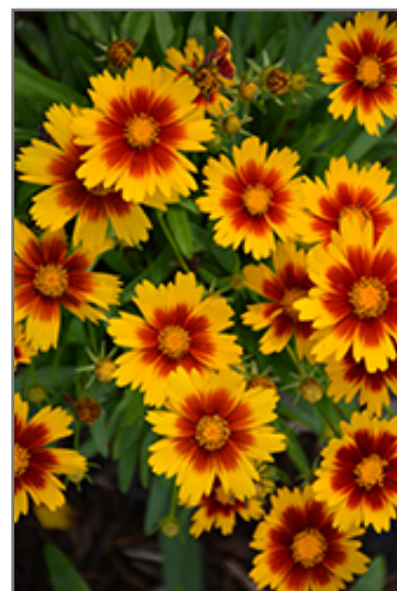
UpTick Gold and Bronze Tickseed flowers

UpTick Gold and Bronze Tickseed is recommended for the following landscape applications;