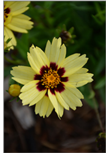
UpTick Cream and Red Tickseed flowers

This plant is not reliably hardy in our region, and certain restrictions may apply; contact the store for more information.