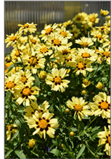
UpTick Cream and Red Tickseed flowers

UpTick Cream and Red Tickseed is recommended for the following landscape applications;