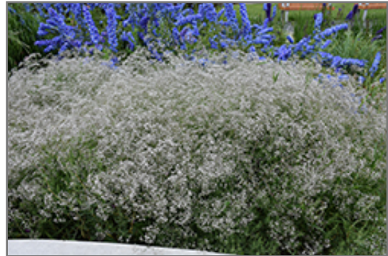
Common Baby's Breath in bloom