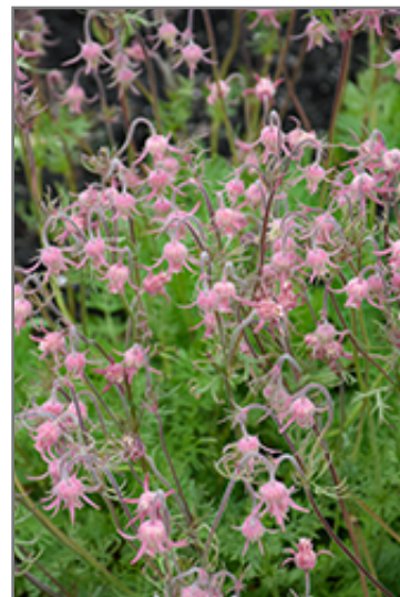
Prairie Smoke flowers

Prairie Smoke is recommended for the following landscape applications;