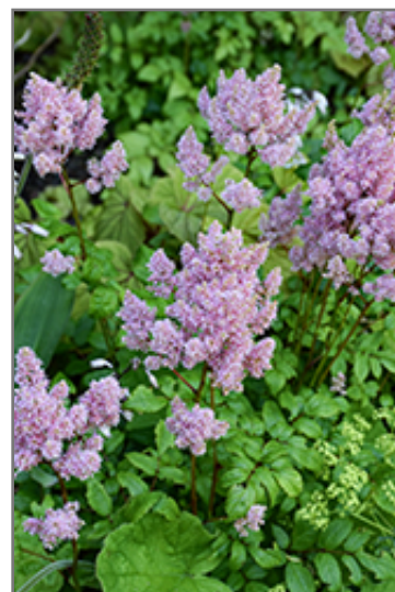
Ice Cream Astilbe flowers

Ice Cream Astilbe is recommended for the following landscape applications;