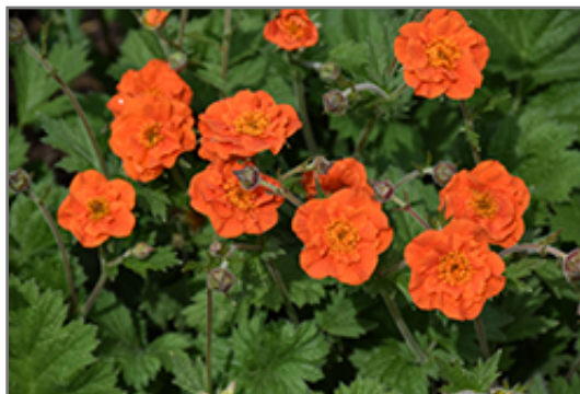
Werner Arends Avens flowers

Werner Arends Avens is recommended for the following landscape applications;