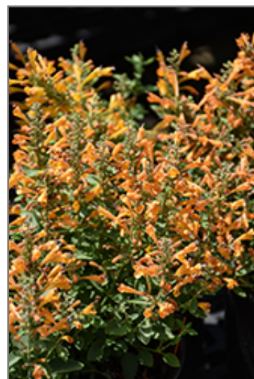
Arizona Sandstone Hyssop flowers

Arizona Sandstone Hyssop is recommended for the following landscape applications;