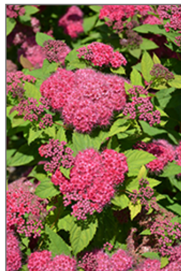
Double Play Red Spirea flowers

Double Play Red Spirea is recommended for the following landscape applications;