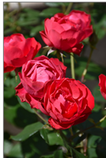
Oso Easy Double Red Rose flowers

Oso Easy Double Red Rose is recommended for the following landscape applications;