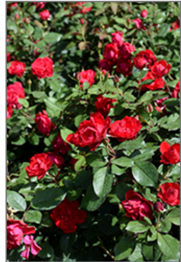
Oso Easy Double Red Rose flowers

This plant is not reliably hardy in our region, and certain restrictions may apply; contact the store for more information.