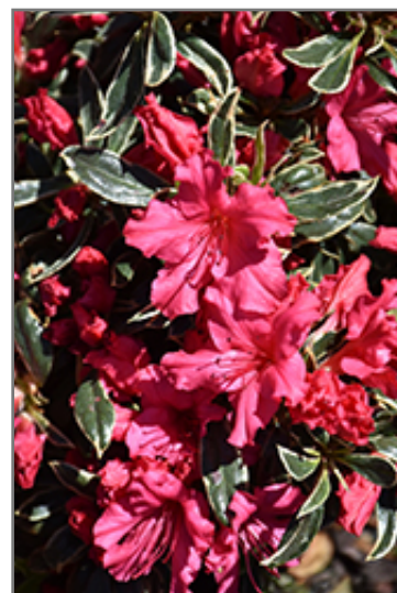
Silver Sword Azalea flowers

Silver Sword Azalea will grow to be about 3 feet tall at maturity, with a spread of 5 feet. It tends to be a little leggy, with a typical clearance of 1 foot from the ground. It grows at a slow rate, and under ideal conditions can be expected to live for 40 years or more.