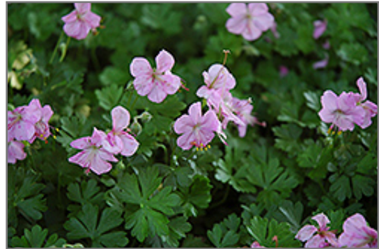
Dalmatian Cranesbill flowers

Dalmatian Cranesbill is recommended for the following landscape applications;