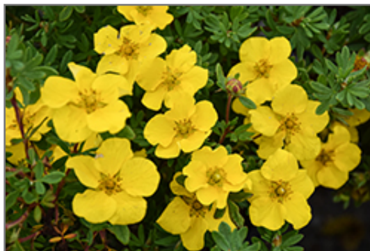
Happy Face Yellow Potentilla flowers