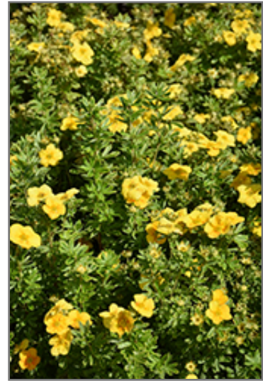
Happy Face Yellow Potentilla flowers

This shrub does best in full sun to partial shade. It is very adaptable to both dry and moist locations, and should do just fine under typical garden conditions. It is considered to be drought-tolerant, and thus makes an ideal choice for a low-water garden or xeriscape application. It is not particular as to soil type or pH. It is highly tolerant of urban pollution and will even thrive in inner city environments. This is a selection of a native North American species.