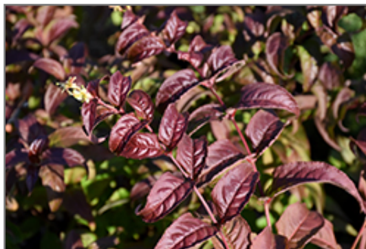
Kodiak Black Diervilla foliage

Kodiak Black Diervilla is recommended for the following landscape applications;