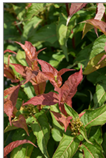
Kodiak Orange Diervilla foliage

Kodiak Orange Diervilla is recommended for the following landscape applications;