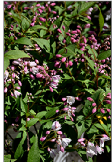
Yuki Cherry Blossom Deutzia flowers

This plant is not reliably hardy in our region, and certain restrictions may apply; contact the store for more information.