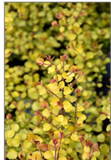
Cesky Gold Dwarf Birch foliage