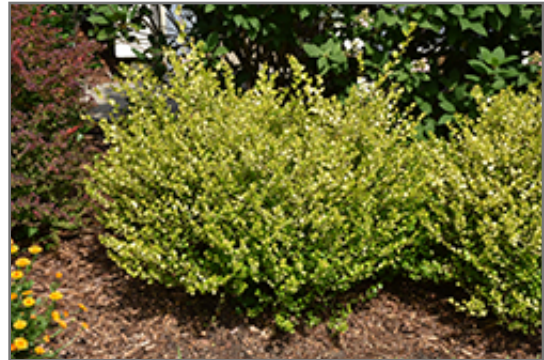
Cesky Gold Dwarf Birch