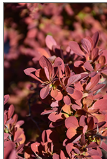
First Editions Toscana Barberry foliage