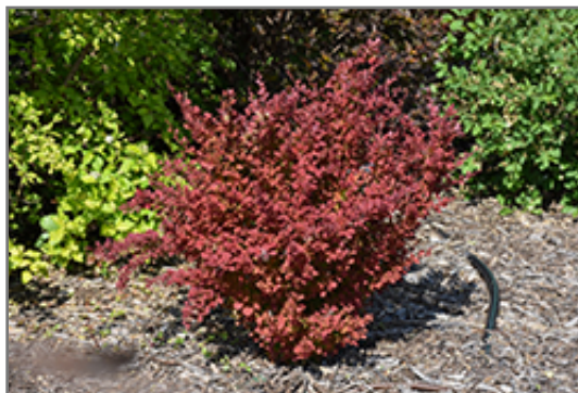
First Editions Toscana Barberry

First Editions Toscana Barberry is recommended for the following landscape applications;